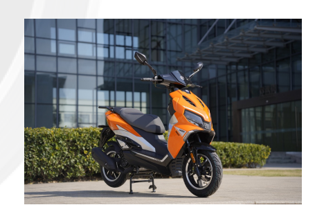
More colours available