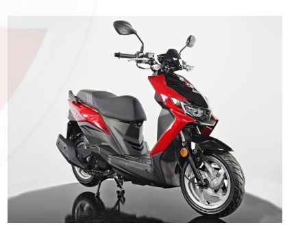
More colours available