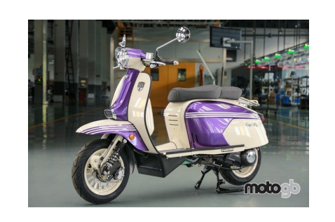
More colours available